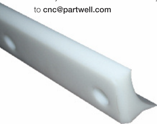
PE500g Natural scraper