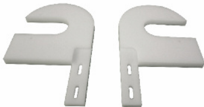
PE 500g Natural side rails for conveyor