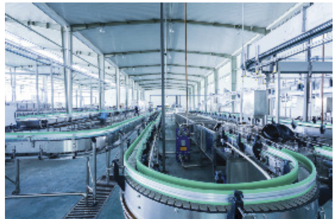
Conveyor wear strip Green/Black 1000g

For a quotation on any bespoke plastic parts please contact the CNC engineering department directly on 01254 295707 or email your drawings to cnc@partwell.com