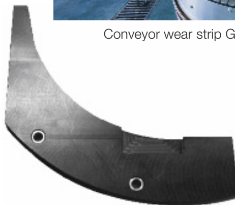
Acetal finger guard