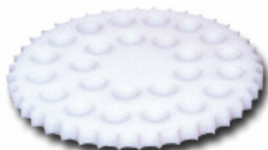
PE1000g Natural wear plate