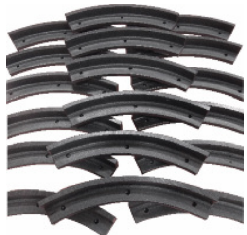
PE1000g regen black wear pads